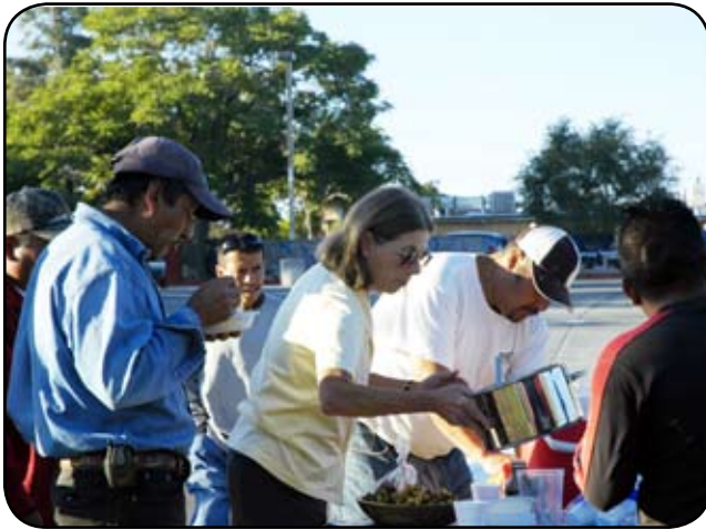
Judge Lynn Pickard at Los Amigos del Parque at Our Lady of Guadalupe Church in Santa Fe.

Just about every Thursday morning, Judge Lynn Pickard is found setting up tables of coffee, fruit, bread and eggs for the immigrant day laborers outside Our Lady of Guadalupe Church in Santa Fe.