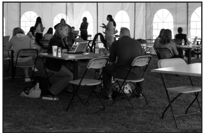
YLD volunteer attorneys discuss estate planning information with first responders at the September 11, 2008 Wills for Heroes Event.